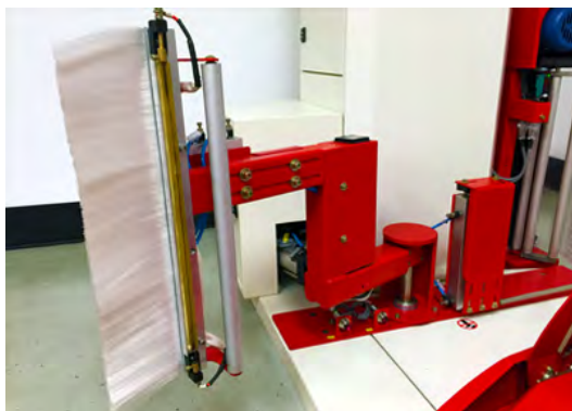
Automatic Film Cut and Wipe Arm

* 3-year parts warranty * (unlimited cycles)