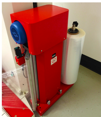
Film Carriage Assembly